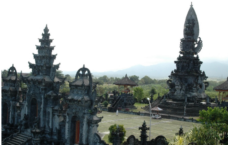
Photo 5 Temple that is sthana (dwelling place) of Ida Sang Hyang Widhi Wasa.

concept of Hinduism to beautify the temple is like self-dressing. The position of humans as a jagad alit is always alive, developing, and full of dependence on the jagad gede (the nature), while the jagad alit absorbs the jagad gede . This situation is a form of embodiment of the basic concept of Hindu community life in Bali. The concept is based on the rwa bhineda concept to lead to harmony and the balance of life on the principle of devotional service. In addition to temples appearing beautiful and magnificent, kriya makes it a heaven on earth and also increase the close ties of community solidarity. For this reason, kriya is not only for mere beauty and entertainment, but also as important religious goals (Haviland 1995). The temple as a holy place of origin, the temple for the lord of the ground, and finally the villager will later also worship the deified forefather, or clan and villager founder. The beauty of the temple shows the reciprocity between art and the collective awareness of the community. The appearance of the temple reflects the strength of the people's belief in their religion for sacred and magical purposes that are full of peace and natural both physically and spiritually (Soekiman 2000).